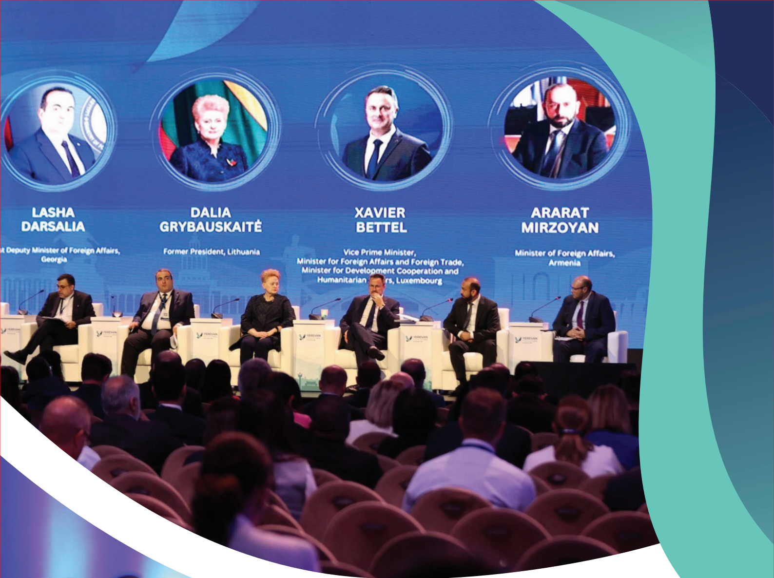
LASHA DARSALIA Deputy Minister of Foreign Affairs, Georgia